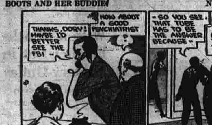
BOOTS AND HER BUDDIE