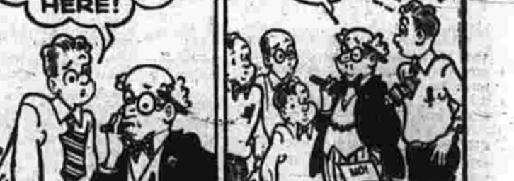
BY RAY CRANK

Head to Toe Fave For work or sports, you'll find a colorful assortment of smart looking VISION CAPS.