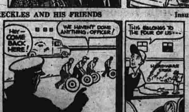
FRECKLES AND HIS FRIENDS