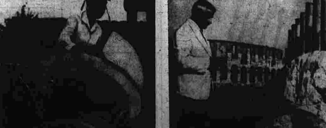
RETURN TO U. S. - Mohammed Ali, former Prime Minister of Pakistan, has been appointed Ambassador to U. S. He held the post in 1952-53 before becoming Premier.