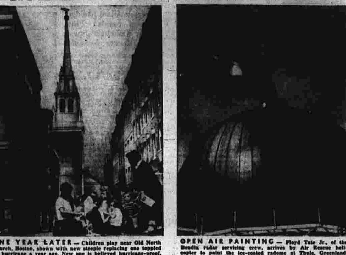
ONE YEAR LATER - Children play near Old North Church, Boston, with new steeple replacing one toppled by hurricane a year ago. New one is believed hurricane-proof.